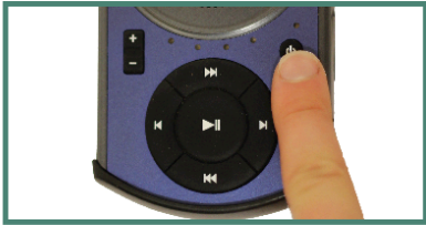
Hold 2 seconds to power