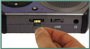
Insert MicroSD card